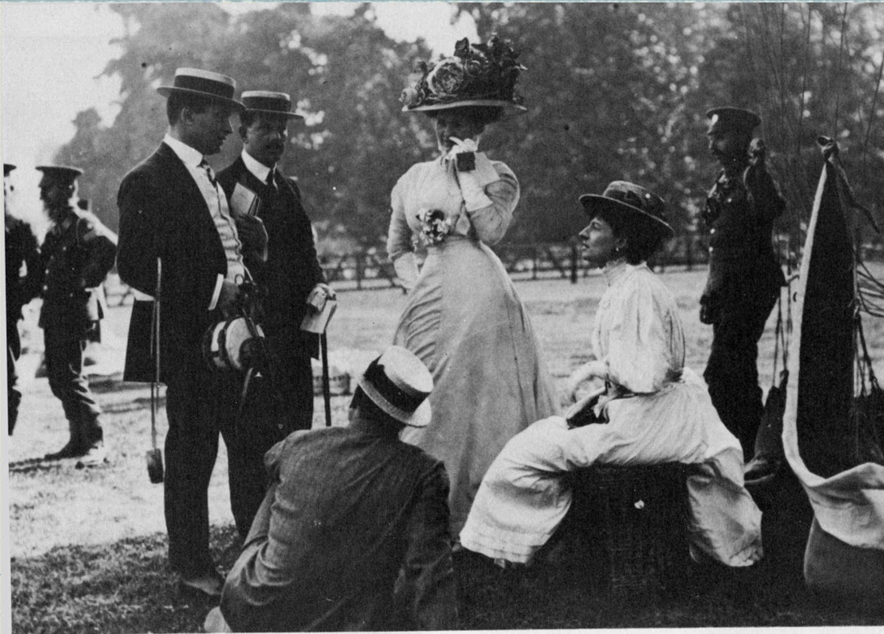
204 Balloon race at Ranelagh, 1908